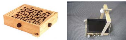
Figure 1. The Brio labyrinth, in the original version and a modified version with a camera and step-motors added

The findings discussed in this paper stem from empirical work in an open-ended project-based course in computer systems for computer science students in their third and fourth year, often referred to as the Runestone course ([1], [5]). The students worked in cross-national teams of six, with three students located in Sweden at Uppsala University and three in Michigan in USA, at Grand Valley State University. In their project teams, the students developed a software system to control a motorised toy, a Brio labyrinth, from a web-browser, see Figure 1. The task was demanding for the students; to succeed the team members had to collaborate. They interacted using different ICT-based tools, such as IRC and e-mail.