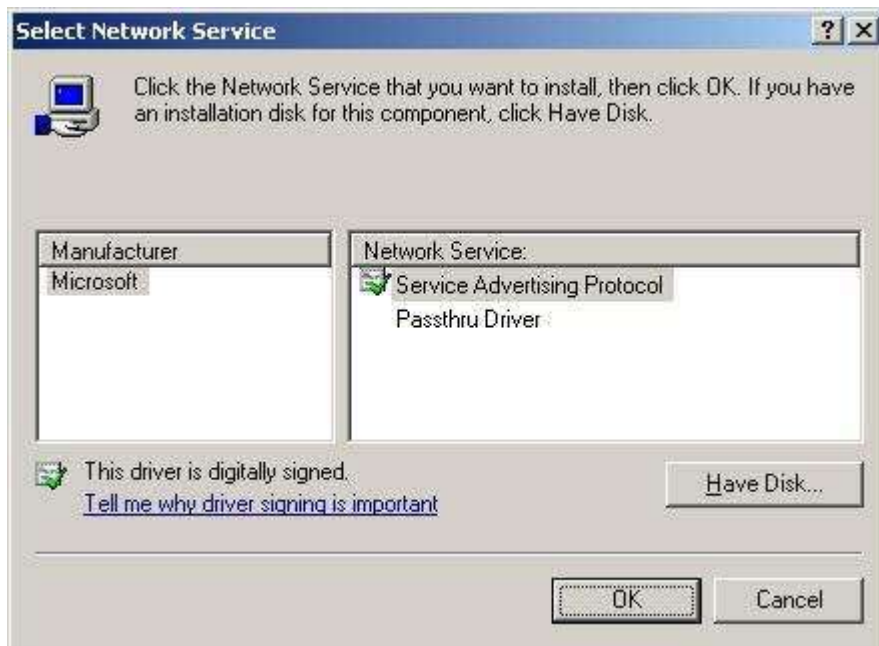
Figure 4: Select “Have Disk...”

3. In the “Select Network Service” dialog that comes next, select “Have Disk...”, browse to the folder you installed Lunar to and select the "netsf.inf" file. Select "Lunar Driver" and press "OK".