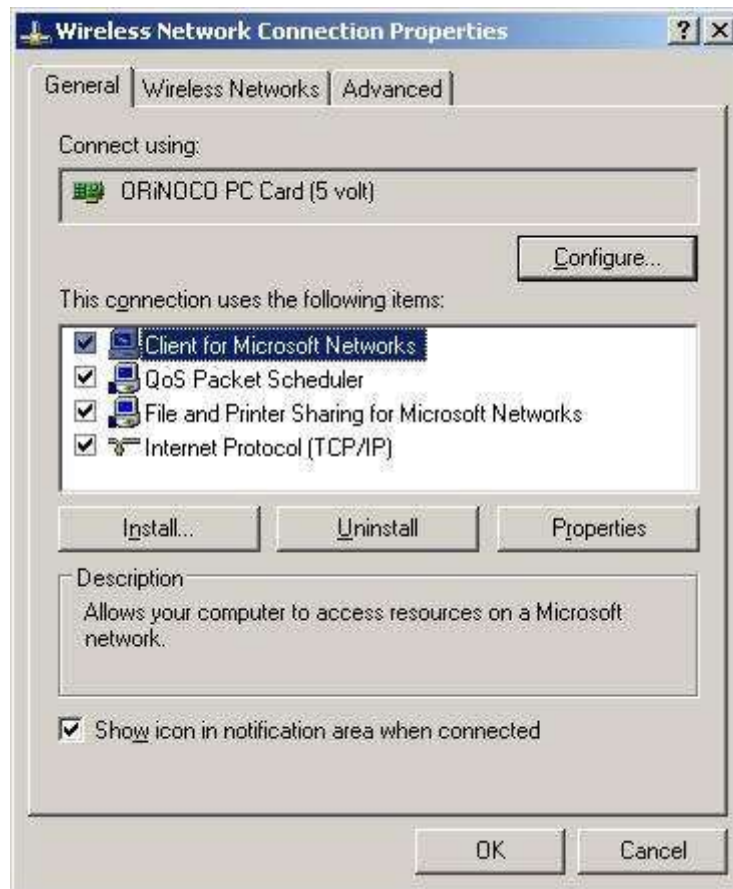
Figure 2: Wireless Network Connection Properties dialog