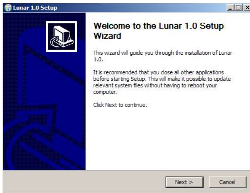
Figure 1: Press Next to start the installation

0. Run the LunarSetup.exe file to extract the Lunar files to the directory of your choice.