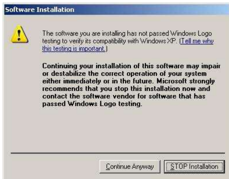
Figure 5: Warning dialog that appears because the driver is not Microsoft certified

4. Then a number of warning dialogs will (or at least may) appear because this driver is not signed by Microsoft. Click "Continue Anyway" in all these dialogs (note that there may be quite a lot of them) and the driver will be installed.