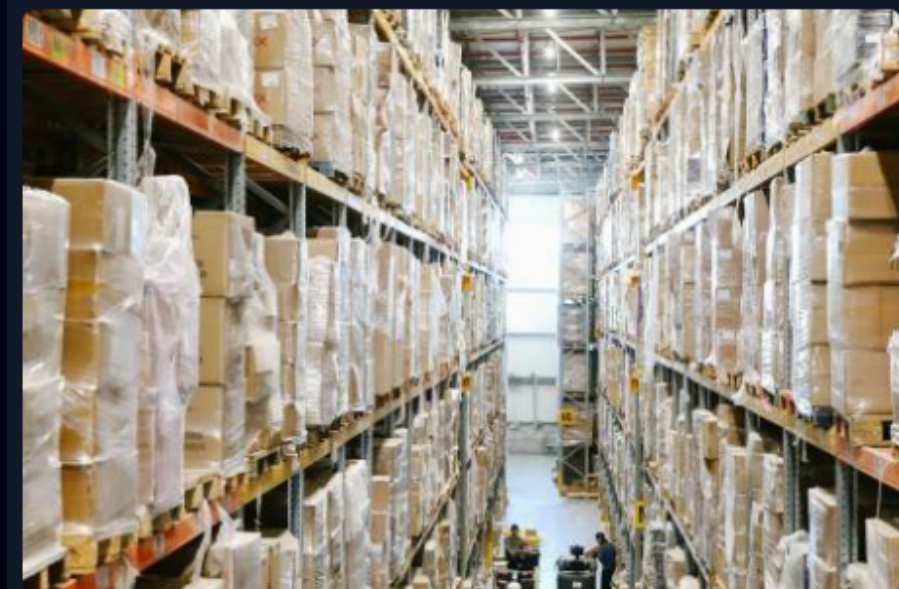
Warehouse Staff Planning