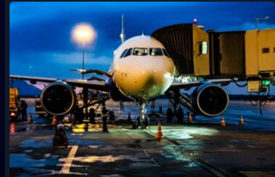
Airport & Catering Logistics