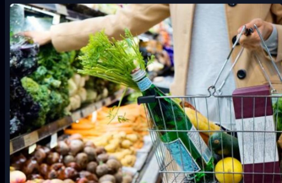
Retail Staff Optimization