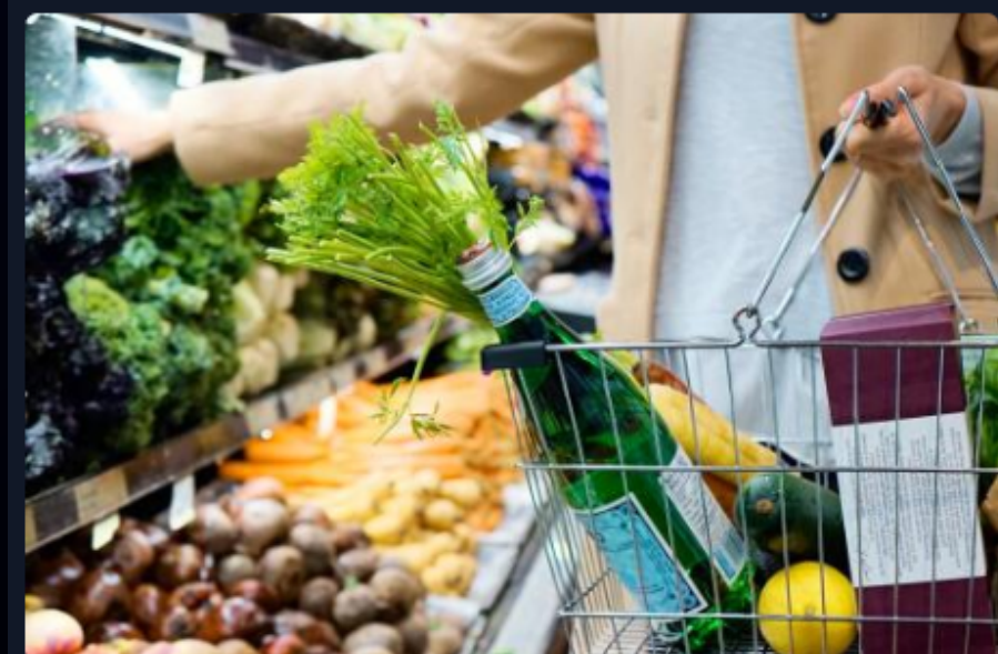
Retail Staff Optimization